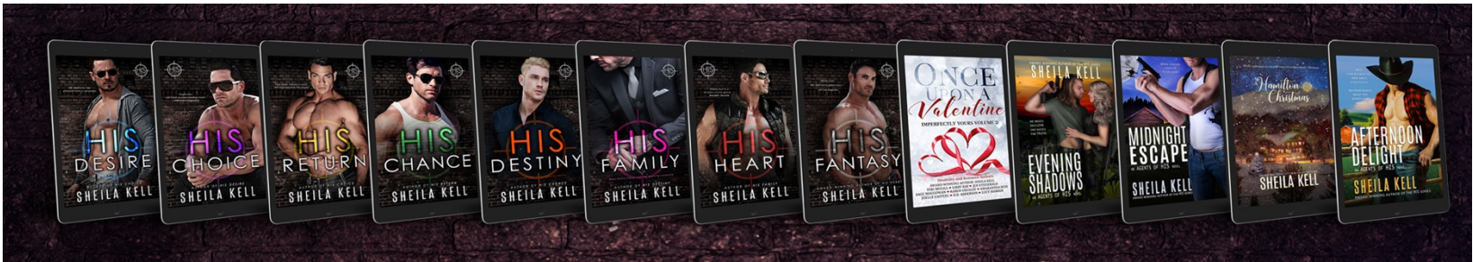
Reading order, but they don't have to be read in order. It's just more fun if you do.

AJ: “In the past, our prissy little sister has been giving you a taste of her so-called times of getting one on us. Well, we’re here to tattle on her, per se.” Brad: “Turnabout is fair play.” Jake: “You know I can’t be part of this, right? I’d be in the doghouse for weeks if not months.” Jesse: “We see who runs that family.” Jake: “Like Kate doesn’t run yours?” Matt: “Come on, let’s tell our story about Emily and get this over with. I’m still not comfortable with dishing on our sister.” Devon: “Are we talking about when she went to college, and we had to bail her out of jail?” Jake: “Come on now, the charges were dropped. She was just in the wrong place at the wrong time.” Brad: “She was in a bar fight, Jake!” Trent: “Let me tell this tale, because you’ll only fight.”