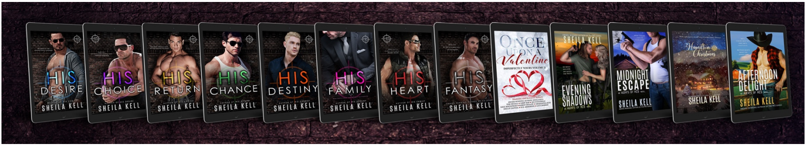
Reading order, but they don’t have to be read in order. It’s just more fun if you do.