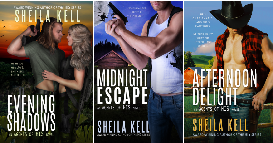
Photo Caption: Evening Shadows-Killion Group, Midnight Escape-Killion Group, Afternoon Delight-Eric Battershell Photography | All graphics by RMGraphX